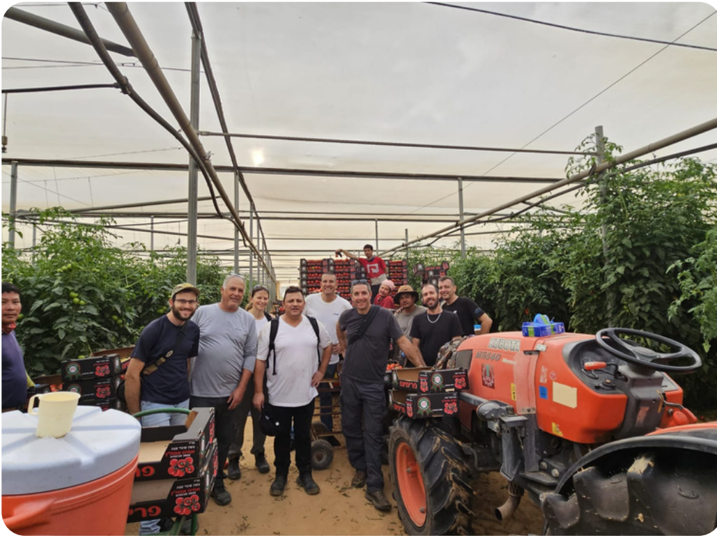
(Leket Volunteers help a struggling farm in southern Israel)